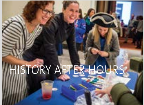
Exhibit continues until Sept. 2, 2019, but discount expires Aug. 18.

Get an additional $2 off* the admission at the Museum of the American Revolution. Enjoy themed programs, extended evening hours, happy hour specials, games and trivia, plus full access to the Museum's exhibits. 101 South Third Street, Philadelphia, PA 19106